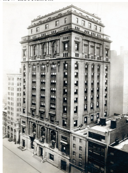
Fig. 1 Home of AIEE - Engineering Societies Building, New York City [3]

The story about electrical engineers' professional associations started more than 130 years ago. At that time, the long-distance telegraph industry was very-well developed, the telephone was invented, and, also, a commercial electric lighting and power station was launched, opening the modern electric utility industry era [2]. In the spring of 1884, a small group of individuals in the electrical professions formed a new organization to support professionals in their nascent field and to aid them in their efforts—the American Institute of Electrical Engineers, (AIEE) [3]. Thomas Edison, Alexander Graham Bell and many other great names had an important role in the new association.