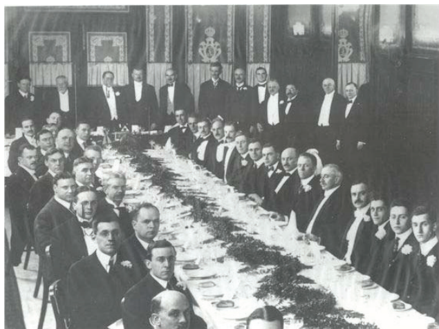
Fig. 2 From the IRE annual banquet, New York 1915, Nikola Tesla is standing (6-th from the left) [4]

Professional associations AIEE and IRE were behind many of history's world-changing technological developments, such as television, radar, satellites, transistors, computers, and others.