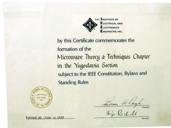
Fig. 4 MTT-17 Chapter foundation certificate [8]